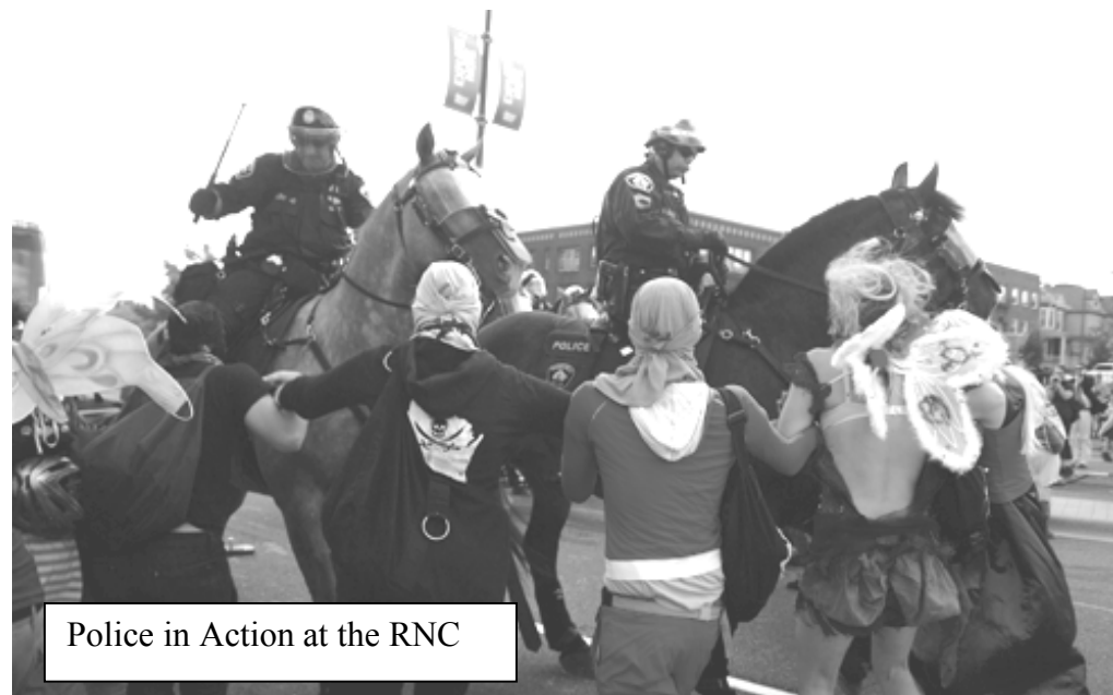
Police in Action at the RNC