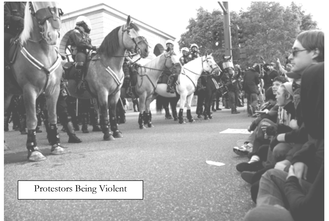
Protestors Being Violent