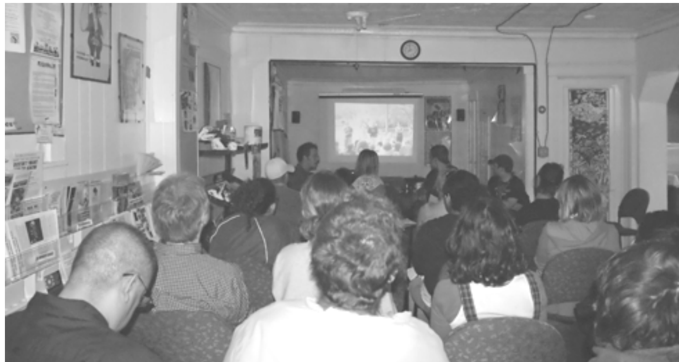
RNC Report-Back Event At Northstar

Global corporations are rapidly becoming involved with local water supplies, trying to combine private profits with what many feel should be a fundamental right to water access. Looking at tensions in Bolivia, India and Stockton, California, "Thirst" reveals how water is becoming the catalyst for explosive community responses to the exploitation of the world's water. This is especially important here in Michigan where local struggles are taking place for water rights.